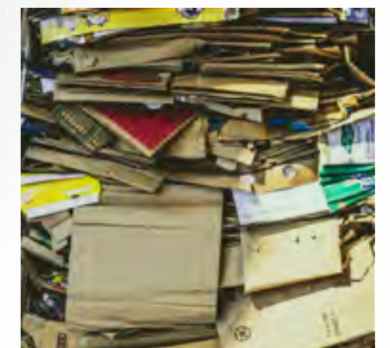
97% recyclable packaging for Non Food products