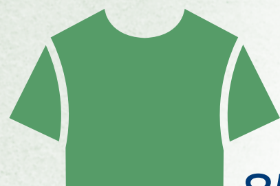
85% of returned Tchibo Share products can be reused